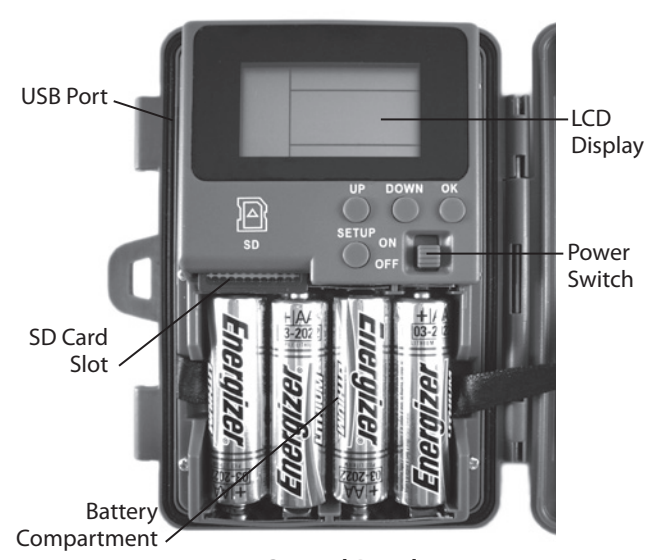
Control Panel (Front Unlatched & Opened)