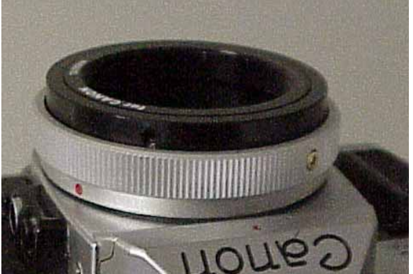
Align the red dot of the appropriate Camera Body Adapter to the red dot on the camera housing and turn clockwise until snug.