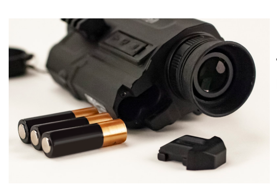
Three AA Batteries Included

USB Power Connection Video Out Port Micro SD Card Slot