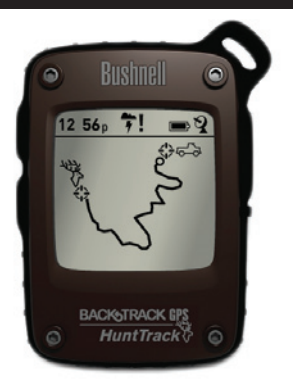
Previous Route Between Locations