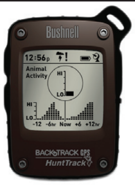
Animal Activity Meter & Predictive Graph